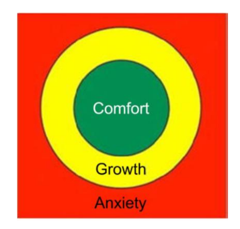
Figure 2. Representative Diagram of the Growth Zone Model based on Lugalia et al. (2013)

The Growth Zone Model (GZM) (Lugalia et al., 2013) is a tool for learners to name and communicate their current, otherwise hidden, feelings when learning mathematics. The GZM has three "zones", as depicted in Figure 2, which represent ways individual learners might experience a situation. The diagram illustrates the difference between being in the "comfort zone" (safe, but without the possibility of personal growth) and being in the "growth zone" (dynamic space in which there is opportunity for growth, for facing challenging situations bravely and effectively) and the need to avoid the overwhelming "anxiety zone". Mathematical resilience manifests itself in the passage from the comfort zone to the growth zone, and thriving there, being able to leave the anxiety zone when it arises. To support this behavior, we were inspired by the ideas of self-efficacy (Bandura, 1994): the mastery of experiences (sharing the idea that experiencing failure is important so that we can build resilience, facing failure as a learning opportunity) and also that self-efficacy can be developed overtime. In addition, we draw on the ideas of optimistic struggling (Seligman, 1991); we encourage participants to maintain a positive attitude despite difficulties.